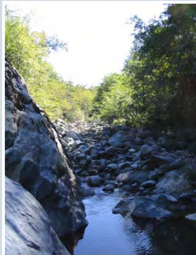
Yager Creek flowing through the Iaquia Ranch.

California Coastal Conservancy California Department of Conservation, California Farmland Conservancy Program California Department of Fish and Game, Coastal Salmon Recovery Program Columbia Foundation County of Humboldt NOAA Fisheries Norcross Wildlife Foundation Pacific Coast Joint Venture Resources Legacy Fund Foundation U.S. Fish and Wildlife Service U.S. Forest Service, Forest Legacy Program