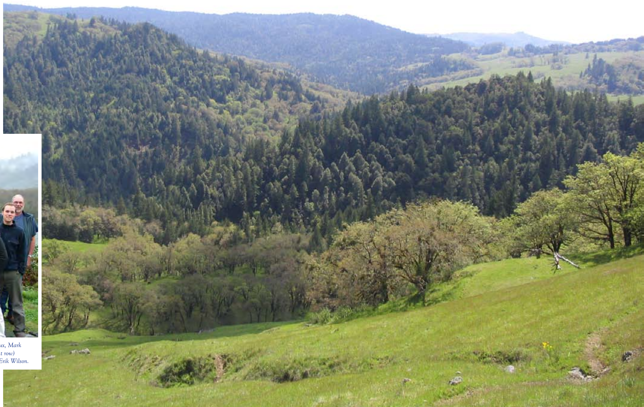
Cover Photo: Iaquia Ranch, part of the Six Rivers to the Sea project.

NRLT works with landowners on a voluntary basis to promote stewardship of Northern California's healthy and productive resource base, natural systems, and quality of life.