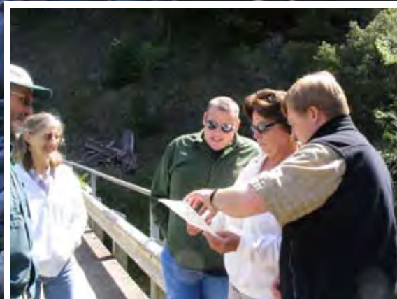
NRLT brought landowners together with agency personnel to facilitate funding for the Iaquia Ranch conservation easement.