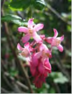
Red flowering currant ( Ribes sanguineum ) at Freshwater Farms Reserve.

Thank you, our members and supporters, for taking the Northcoast Regional Land Trust through another year of outstanding success and growth. Our shared promise to keep the North Coast beautiful, productive and unique launched NRLT into a number of new programs and stabilized existing ones, bringing us ever closer to our vision of a balanced ecology, culture and economy. As the following illustrates, our staff and board managed an impressive list of accomplishments in 2006, most notably with the first two Six Rivers to the Sea conservation easements: