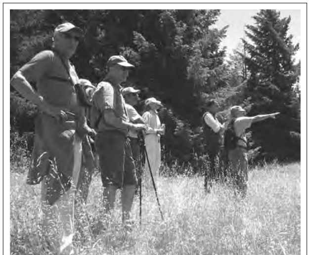
NRLT members get involved with a tour of one of the recently conserved properties.