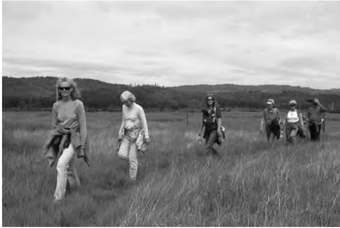
Hikers on the interpretive walk at Freshwater Farms Reserve.

The Freshwater Farms Reserve has had a lot of visitors lately. This summer NRLT launched its “Land Use and Environment” interpretive walk series with great success. Using the Freshwater Farms Reserve as a classroom, we have been sharing the story of the bottomlands of Humboldt Bay—the natural history of the land, the grazing regimes, the fish habitat and our own estuary restoration project. Interpretive walks are scheduled for the 1 st Sunday of each month, 2:30-4:30pm. Join Us!