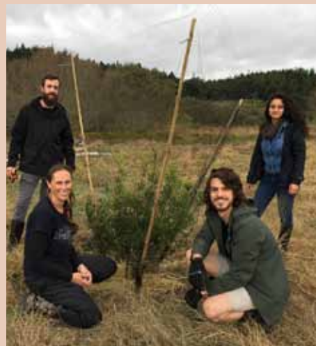
HSU students installing deer fence during a recent Planting Day