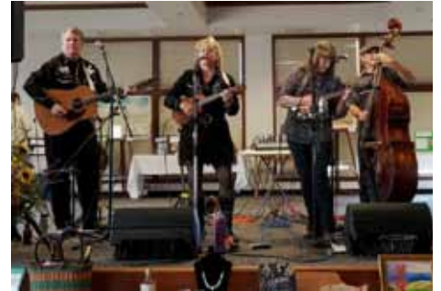
That Buckin' String Band live

SAVE THE DATE! Annual Celebration Saturday, October 13, 2018, River Lodge, Fortuna