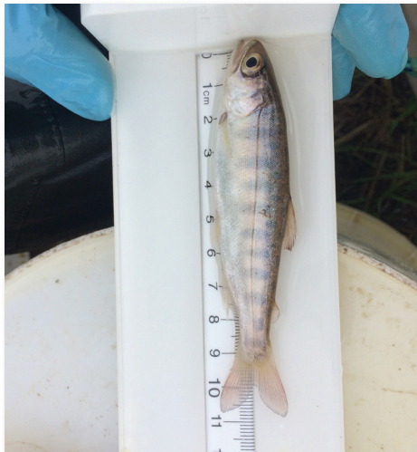
This young coho salmon was found in the Phase II restoration area of Wood Creek.