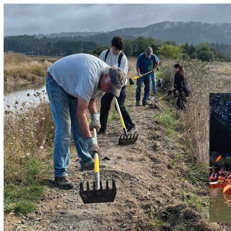
Volunteer Trail Stewards maintain the nature trail on the levy along Freshwater Slough.

In addition to these and other events, we're excited to highlight the ongoing