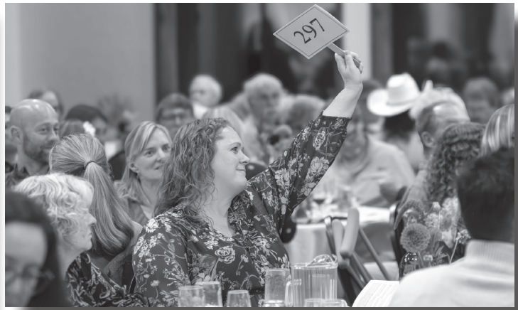
NRLT Supporters bid on local goods and experiences in the live and silent auctions.