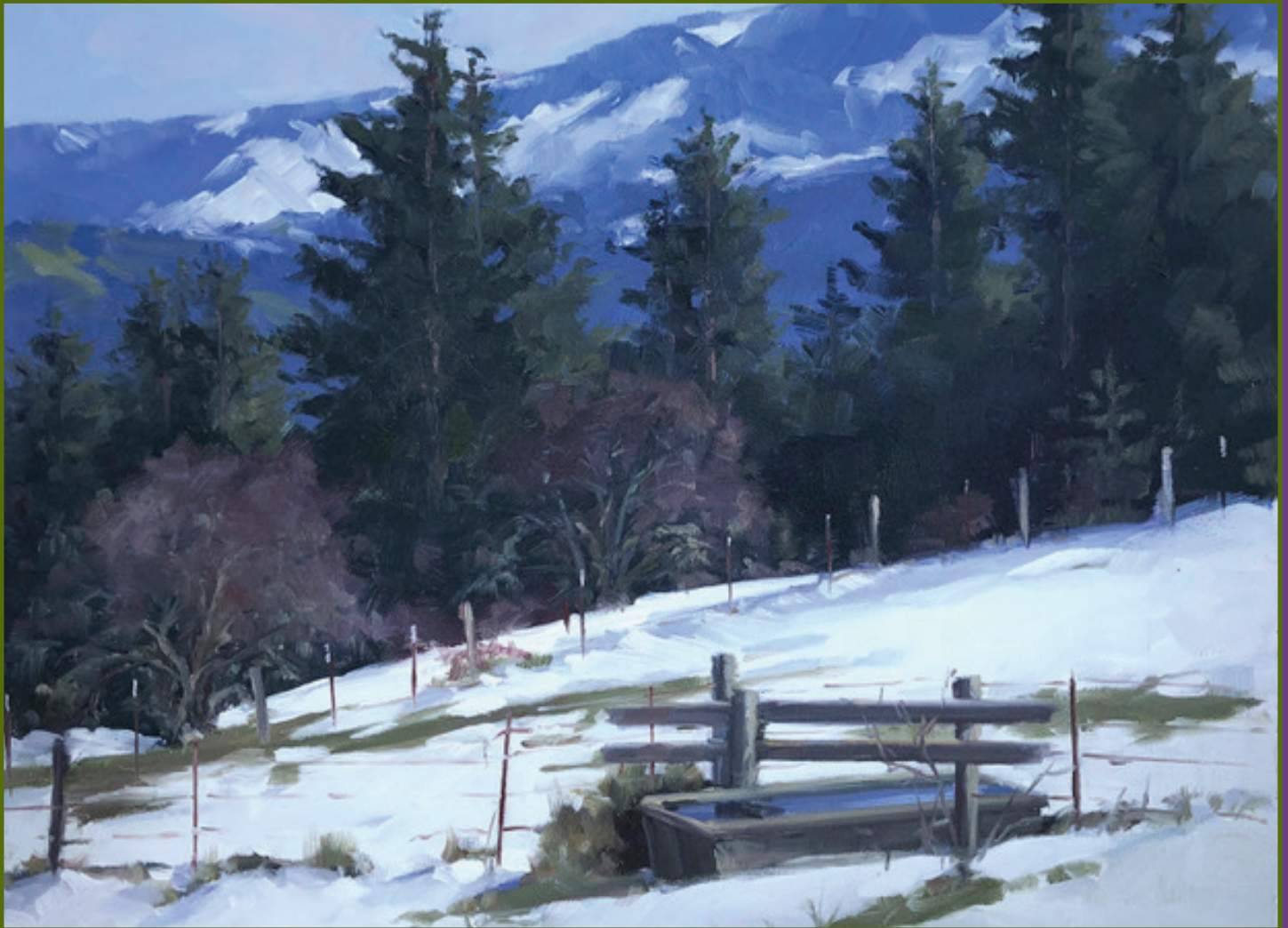
Two Way Water