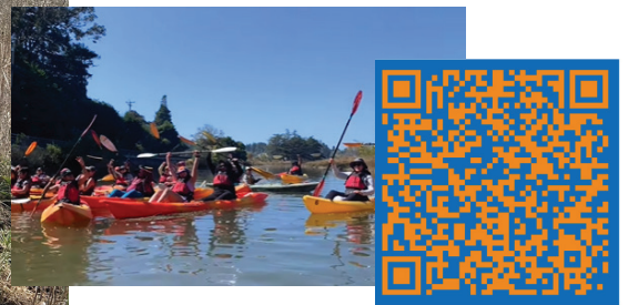
Scan here to watch the Latino Outdoors Humboldt Canoe the Slough video!

Thank you to our community partners, volunteers, participants, and funders for helping us protect and grow this special place!