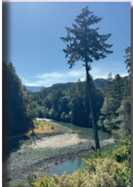
The Butler Valley Ranch Conservation Easement will protect 3.5 miles of the Mad River, ensuring clean water for fish, wildlife, and people.