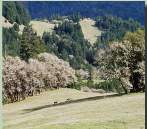
Chalk Mountain Ranch