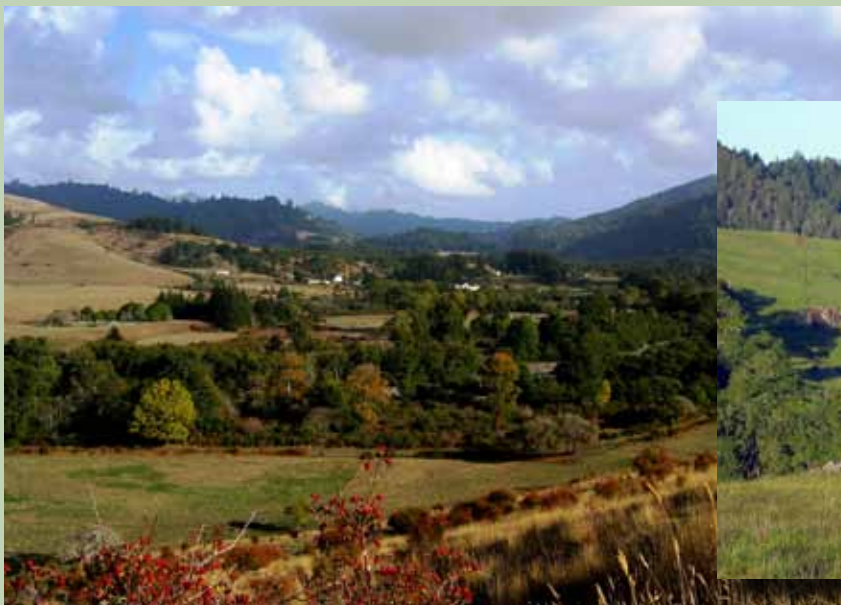
Valley View Ranch

Our next newsletter will feature an exciting new project working with three landowners to expand a complex of conserved lands in an area known for its Port Orford cedar stands. Stay tuned!