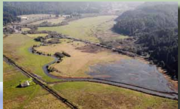
Freshwater Farms Reserve