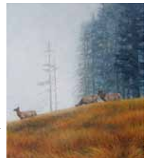
Fog in the Bald Hills