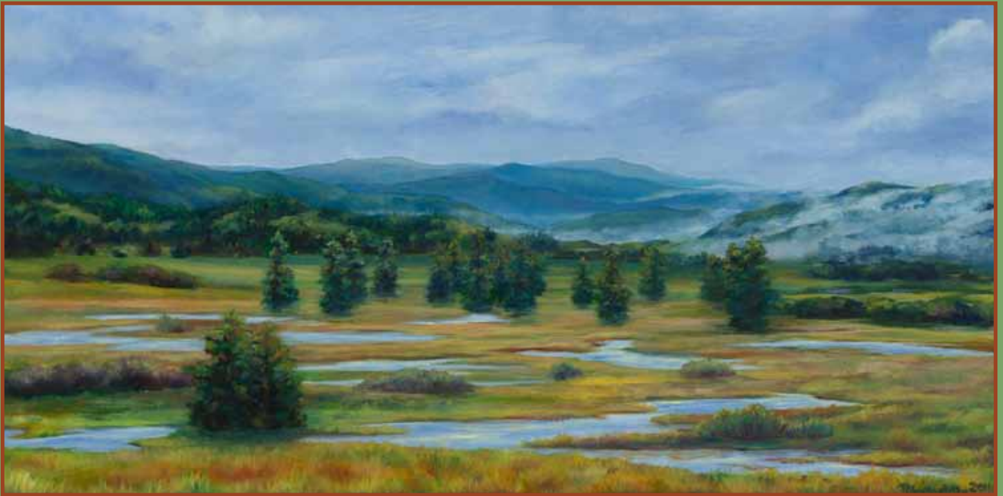
Van Duzen River Watershed – View From Graybrook Ranch