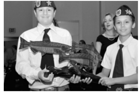
4-H Youth during the live auction