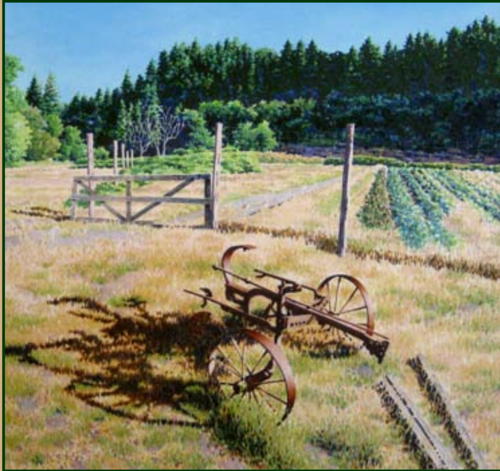
Plow and Gate