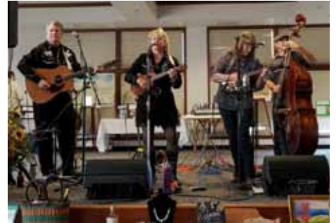
That Buckin' String Band live

SAVE THE DATE! Annual Celebration Saturday, October 13, 2018, River Lodge, Fortuna