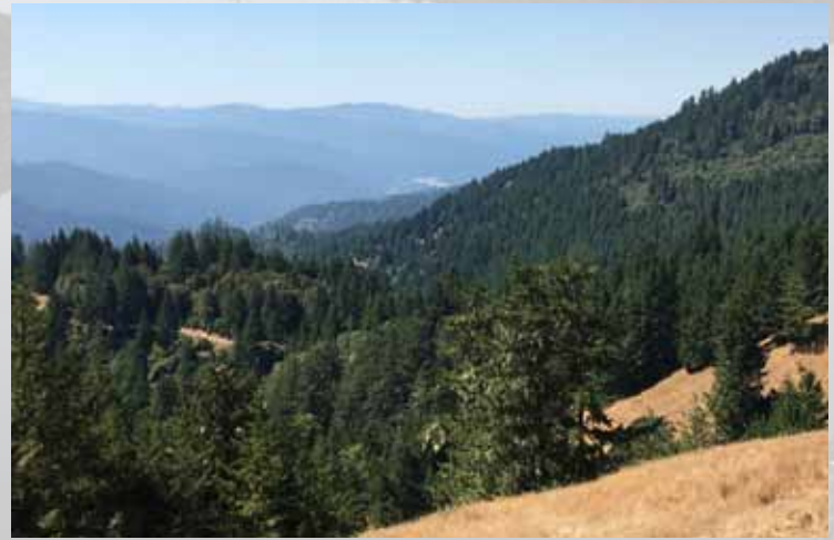
Chalk Mountain Ranch