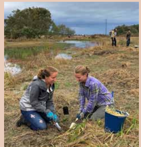
Volunteers preparing to plant along Wood Creek