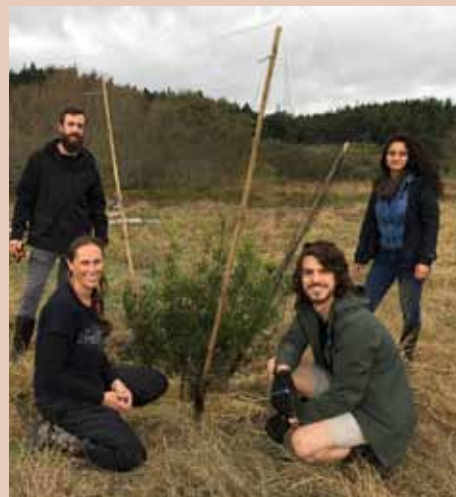
HSU students installing deer fence during a recent Planting Day