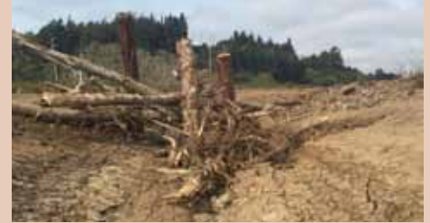
Woody debris installed in Wood Creek as shelter for juvenile salmon