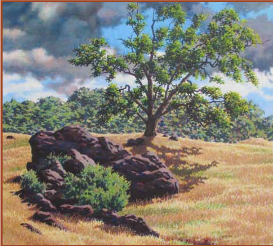
Oak and Rocks