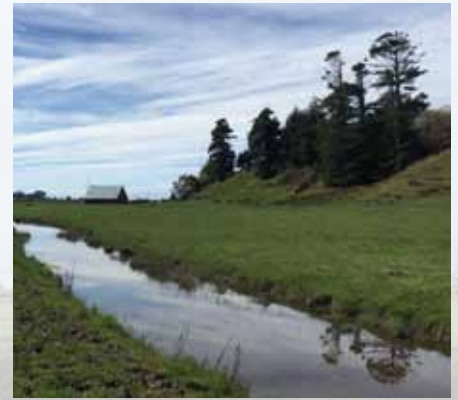
NRLT-owned property, Martin Slough

Because the protection of working lands is central to NRLT's mission, most easement properties are actively managed ranches and timberlands. Yearly visits provide a clear window into the planning and flexibility necessary to work with, on, and for the land. The amount of hard work, planning, and time that landowners put into sustainably managing this region's farms and forests is truly awesome. NRLT is fortunate to work with landowner partners so strongly committed to conservation.