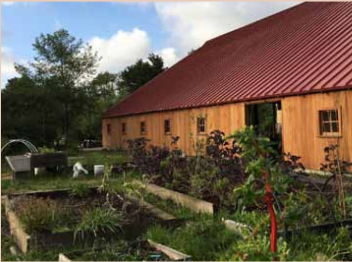
An exterior view of the completed Graham-Long dairy barn