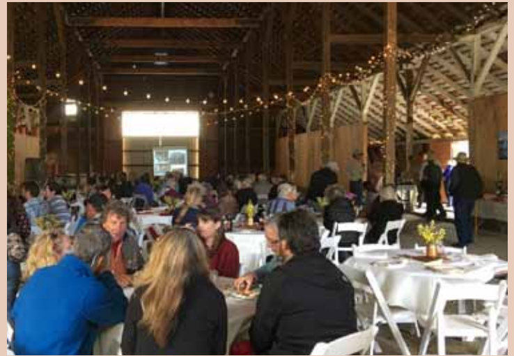
NRLT donors and supporters celebrating together under the barn's new roof