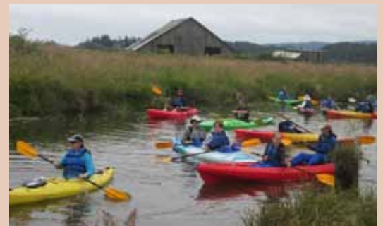
Kayaks of all colors at Canoe the Slough event

Volunteers of all ages helped improve habitat for juvenile salmon in the slough and learned to collect data on native plants and wildlife. The weekend was capped-off with our annual Canoe the Slough event where NRLT partnered with Humboats Kayaking Adventures to lead yet another group of enthusiastic visitors in a colorful contingent of kayaks down Freshwater Slough through the tidal lands to the open waters of Humboldt Bay.