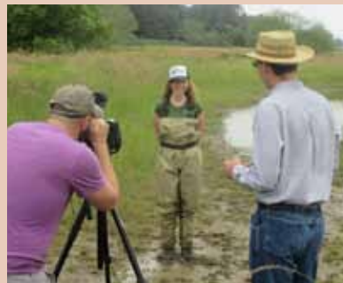
LTA film crew at Freshwater Farms

During this same weekend, NRLT partnered with AmeriCorps' Watershed Stewards Program to host a volunteer restoration day and Bioblitz citizen science event.